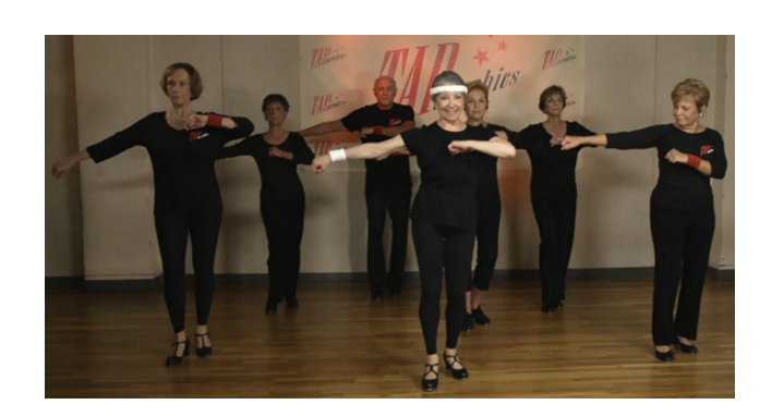
Invest in your good health!

And by purchasing the Dance & Fitness TAPboard^{m} (sold separately), you will have a safe, convenient way to create the feel of a sprung studio dance floor in the comfort of your own home or away. Made of finished Baltic Birch plywood, the TAPboard^{m} is backed with a 1/8" mat for comfort and protection of your joints and floors.